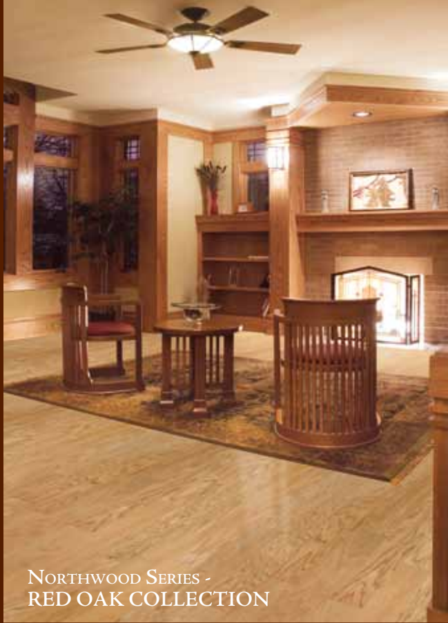
NORTHWOOD SERIES - RED OAK COLLECTION

The multi-directional high density wood fiber core expands and contracts monolithically providing maximum dimensional stability. This moisture resistant core is also denser than plywood and provides the perfect platform for indentation resistance and click installation.