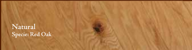
Natural Specie: Red Oak