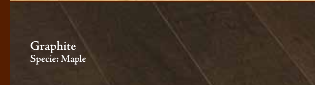
Graphite Specie: Maple