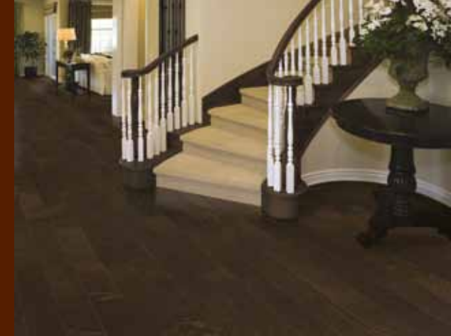
NORTHWOOD SERIES - MAPLE COLLECTION