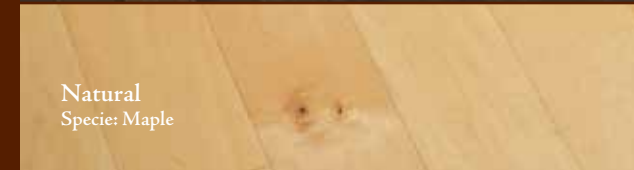
Natural Specie: Maple