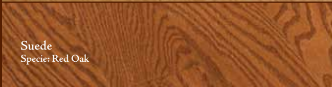
Suede Specie: Red Oak