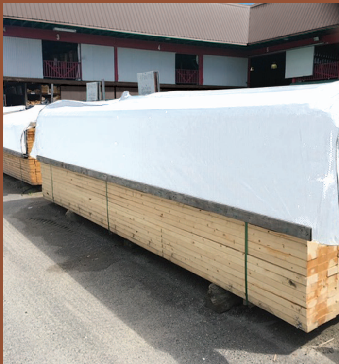
Protection of white framing lumber is equally important.