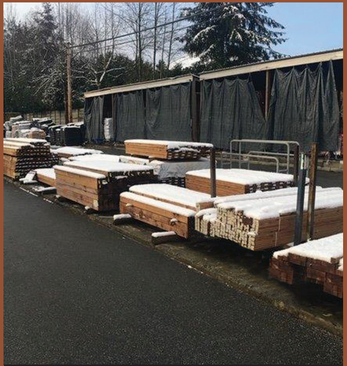
Example of unprotected pressure treated lumber.