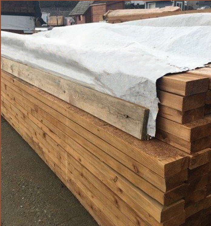
Example of making a "hold down" for lumber wrap.