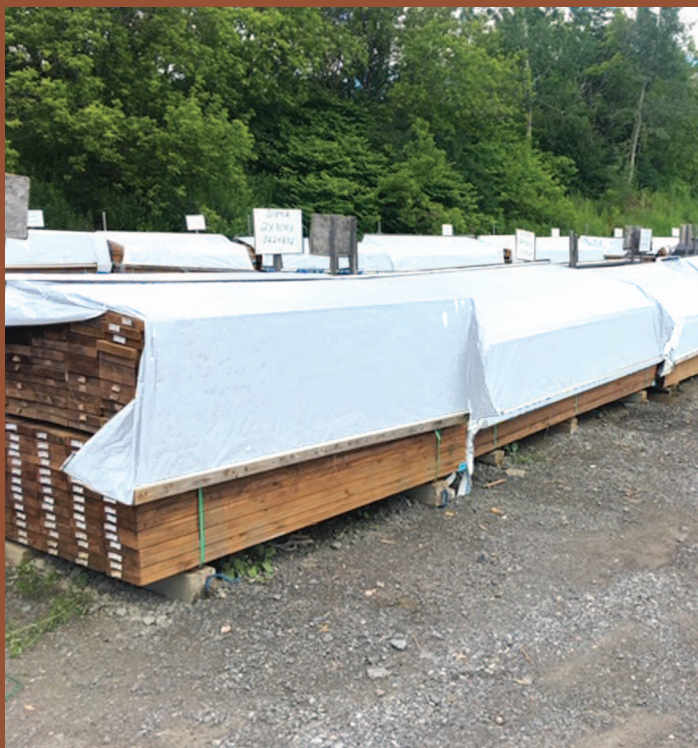
Example of pressure treated lumber. This particular dealer has near zero downfall.