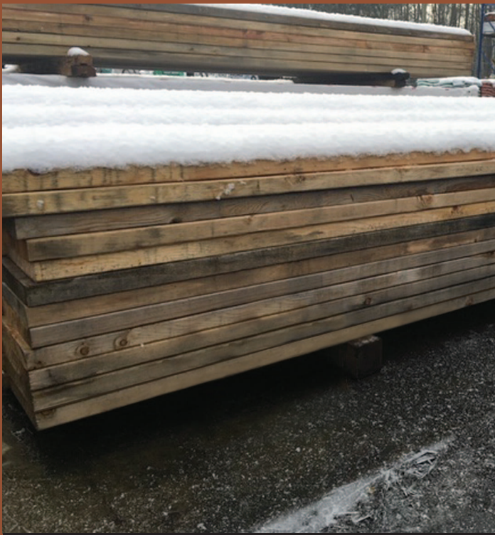
Example of unprotected white framing lumber.