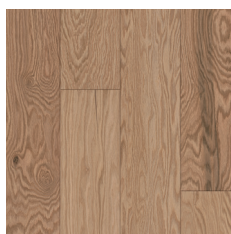
Blonde 6-1/2" EKP64L01SEE