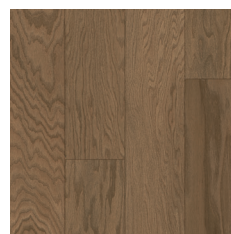
Soft Brown 6-1/2" EKP64L04SEE