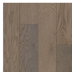
Taupe 6-1/2" EKP64L03SEE