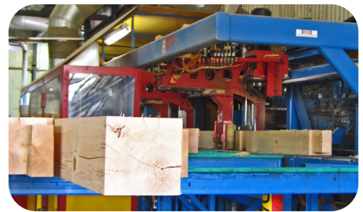
HUNDEGGER K2 FRAMING MACHINE